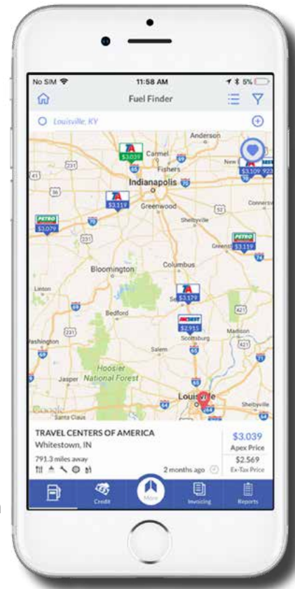
Apex Fuel Finder on the Apex Mobile Factoring™ app, available for your Android® or iOS®.

More and more companies are entering the trucking and transportation space with software designed to improve fuel efficiency. Do your research and ask questions. Some fuel-saving features could come with your ELD platform. Other independent software could integrate with your company and truck data to help identify areas that need improvement. Also, technology is available to automate the IFTA reporting process.